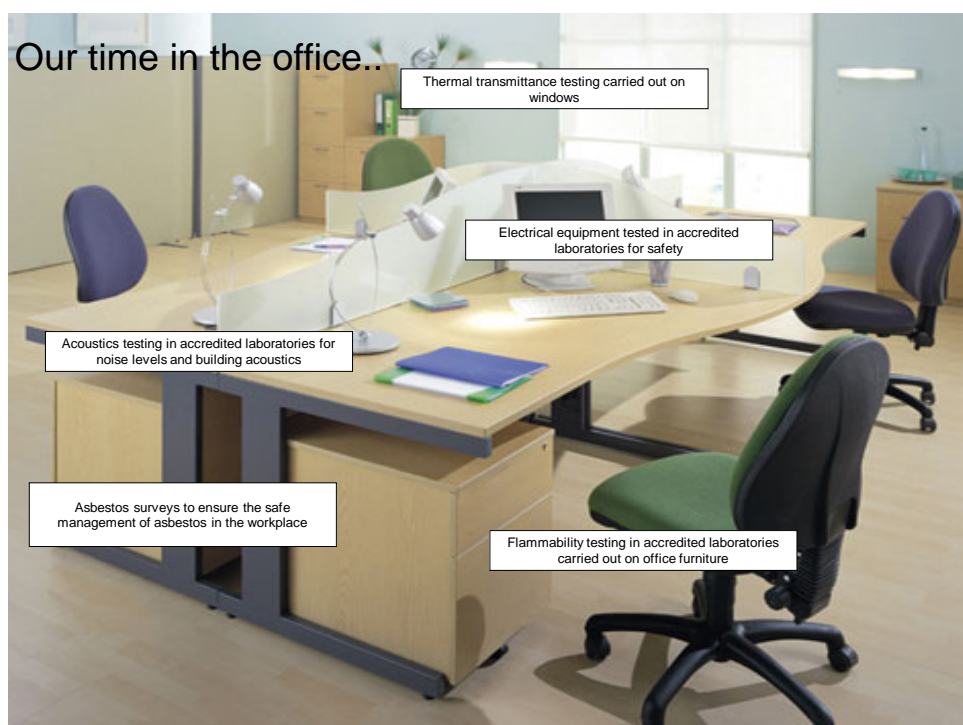
An example: How Accreditation impacts our every day's life in an office (UKAS)

Using accredited laboratories also facilitates trade and economic growth. The accrediting process is based on a reliable and systematic approach to determine the competence of a laboratory, an approach that has been accepted and implemented across borders. But at the same time, accreditation needs to enable a fair competition among accredited laboratories on a global market. This will be compromised if the application and interpretation of the necessary requirements and competences of assessors varies between national accreditation bodies.